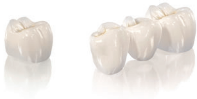
Individually made ceramic crowns and bridges look and feel like natural teeth.

There are many reasons why people lose more than one tooth, such as illness, an accident or simply inheriting poor teeth. This can have a serious impact on your quality of life. And it determines how you approach your continued dental health in the future.