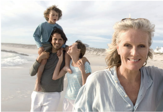
Attractive, healthy teeth are important for health and overall well-being.

Attractive, healthy teeth play an important role in our general health and well-being. You look and feel confident when smiling and laughing with friends and family, anytime and anywhere. Strong teeth enable you to eat favorite foods; so important when maintaining a healthy diet.